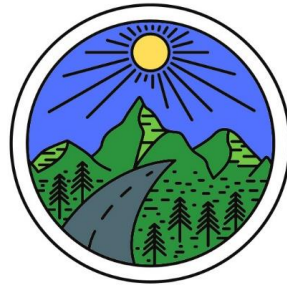
The Great Barwell Adventure